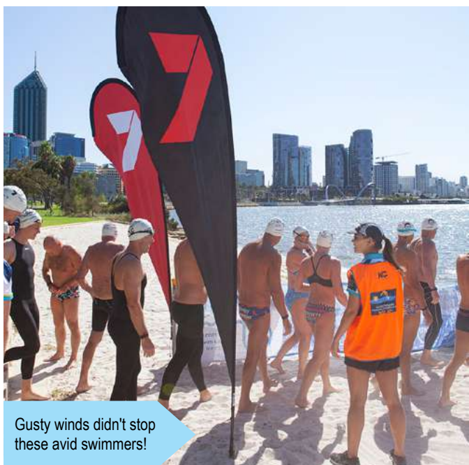
Gusty winds didn't stop these avid swimmers!