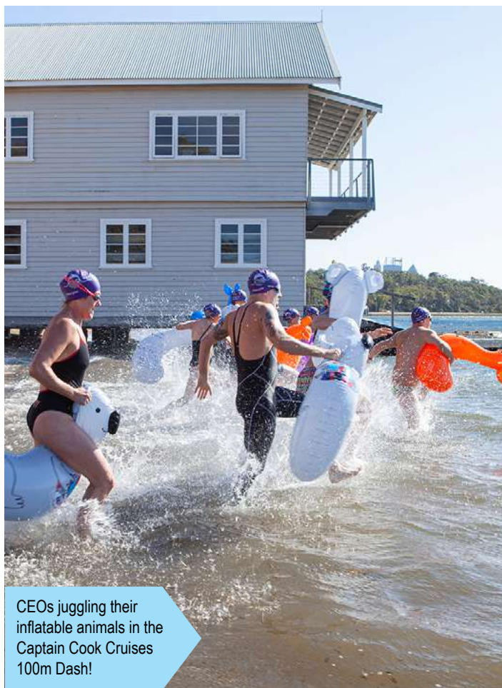
CEOs juggling their inflatable animals in the Captain Cook Cruises 100m Dash!