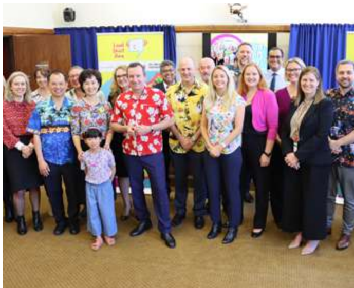
Premier's Loud Shirt Day Morning Tea