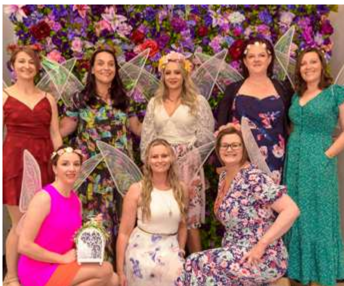
Once Upon a Tea Time High Tea Event