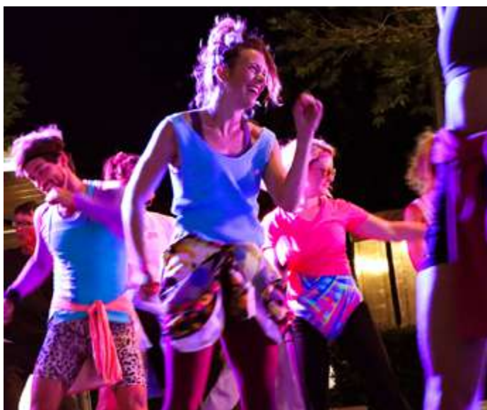
Bike Bar Aerobics Night at Claremont Quarter